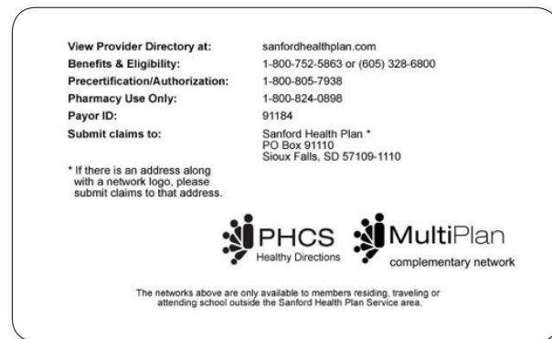
Signature Series Sample ID Card [*Member copay may vary depending on plan selected*]